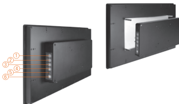
▲ Modularized design