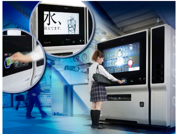
ZYBRID® is a trademark of Zytronic Displays Ltd, registered in the United Kingdom and other countries.

RoHS compliant CE, FCC and UL approved www.zytronic.co.uk/support/quality-assurance